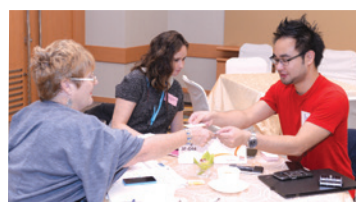
▲ Media Breakfast Meeting 傳媒早餐會