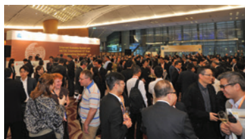
▲ Networking Events 交流活動