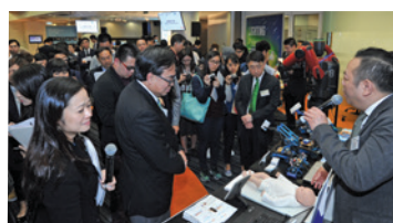
▲ Press Conference 記者招待會