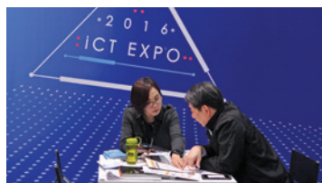
▲ SME IT Clinic offers free consultation to SMEs 中小企IT諮詢服務 免費為中小企提供顧問服務