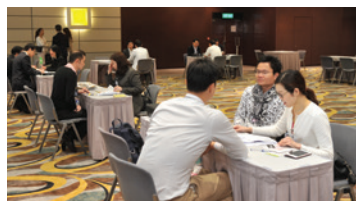
▲ One-on-one Buyer Meetings 一對一買家會議