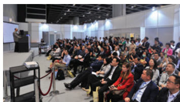
▲ Top-notch Seminars / Conferences 研討會/會議探討熱門話題